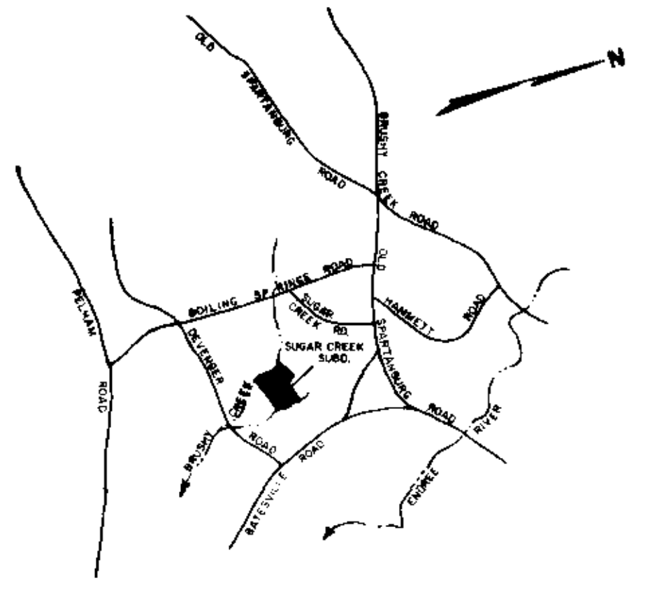
LOCATION MAP N/S